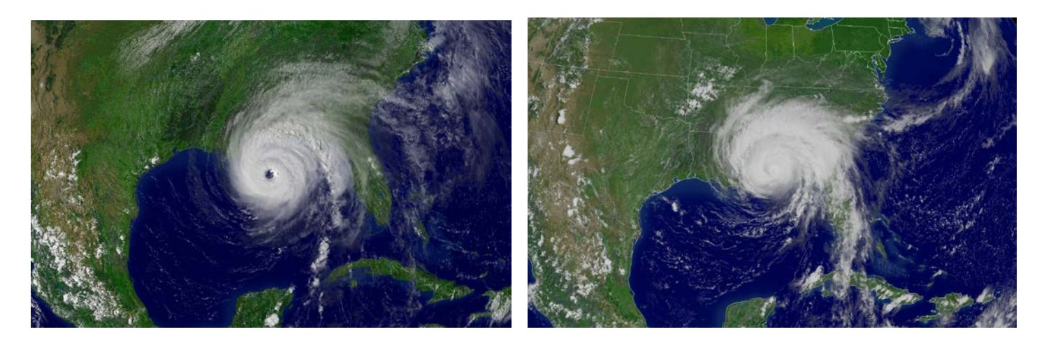
Hurricane Ivan – September 16, 2004