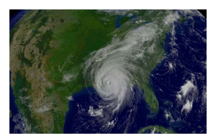
Hurricane Katrina – August 29, 2005