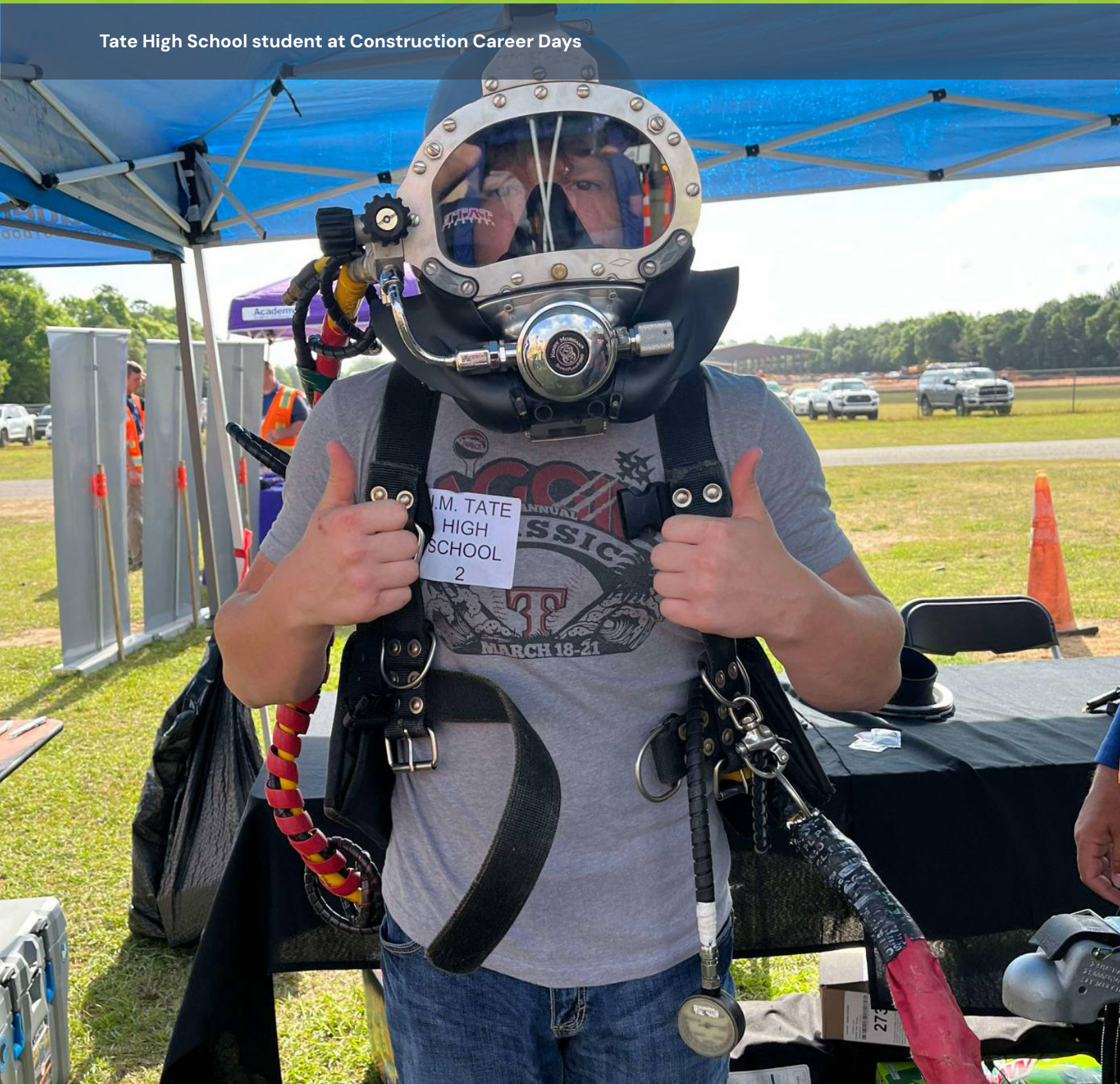
Tate High School student at Construction Career Days